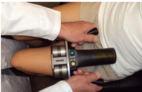
Using the magnet to lengthen the thigh bone

Bleeding can happen during or after the operation and there may be scarring as a result of the cut. If the wound becomes infected it will usually settle with antibiotics but may sometimes need further surgery. There may be altered feeling at the operation site. This may be temporary or permanent