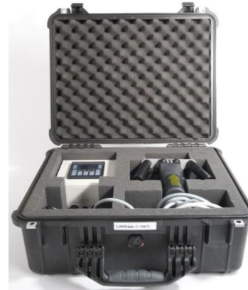
The external remote controller